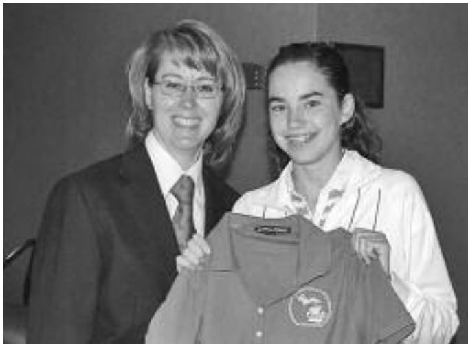
Seventh grader sang the national anthem.